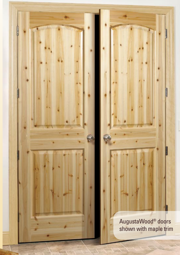
AugustaWood® doors shown with maple trim